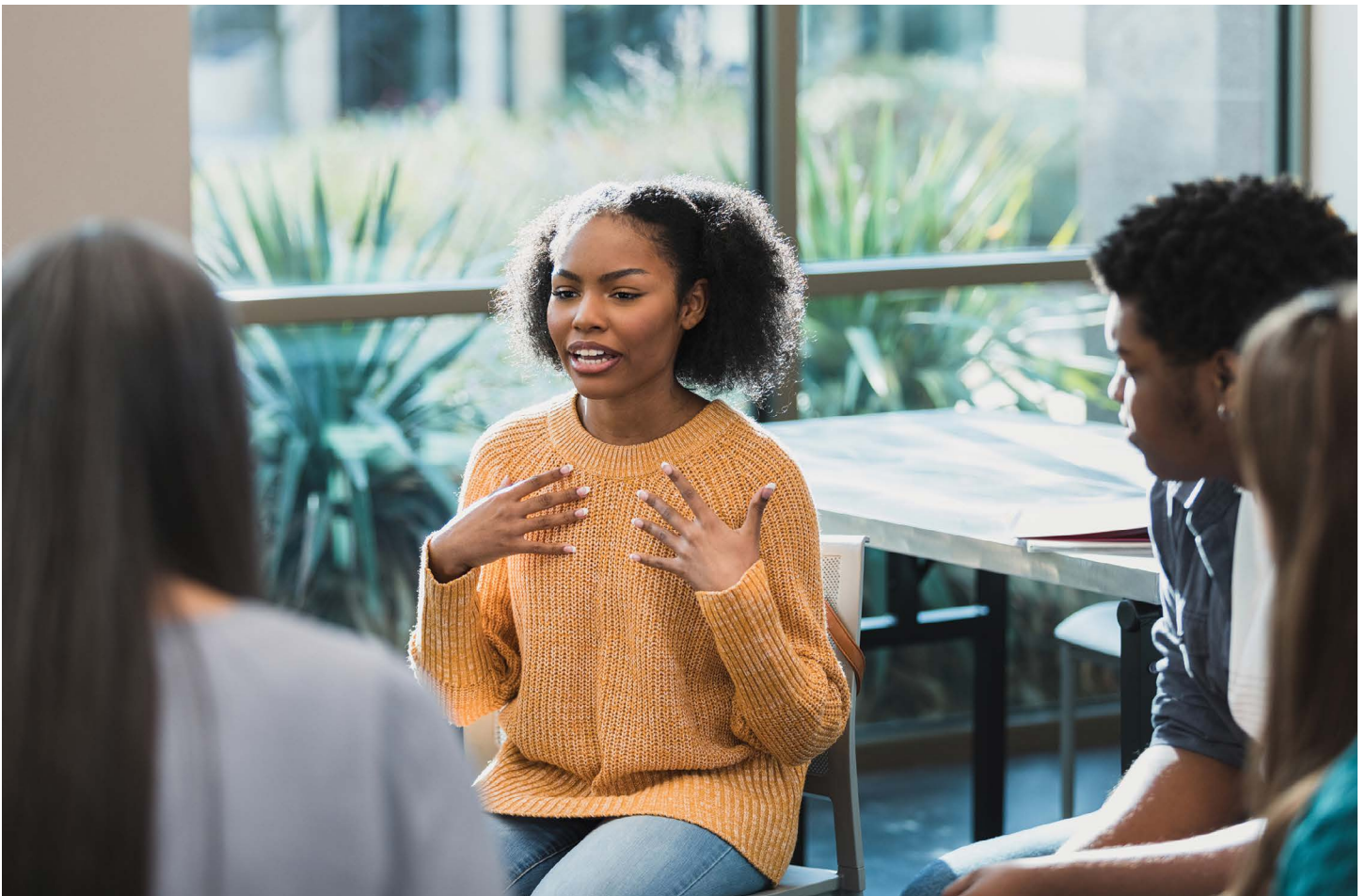
Inclusion of youth with lived experiences of homelessness in the planning and implementation processes through Youth Action Boards was a critical component of YHDP.