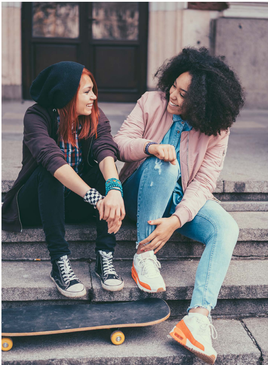
The gender of youth served across all 10 Round One YHDP sites was predominantly female.

Westat used a longitudinal, multiple comparative case study design of the first 10 CoCs selected as part of YHDP's Round One sites and selected