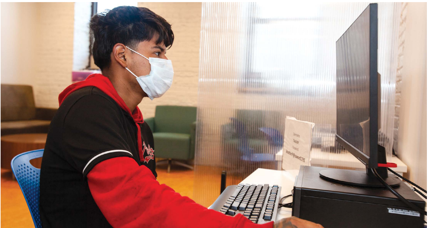
Located at The Crib, The Vibe has computers and internet access so that youth can find employment and pursue education.