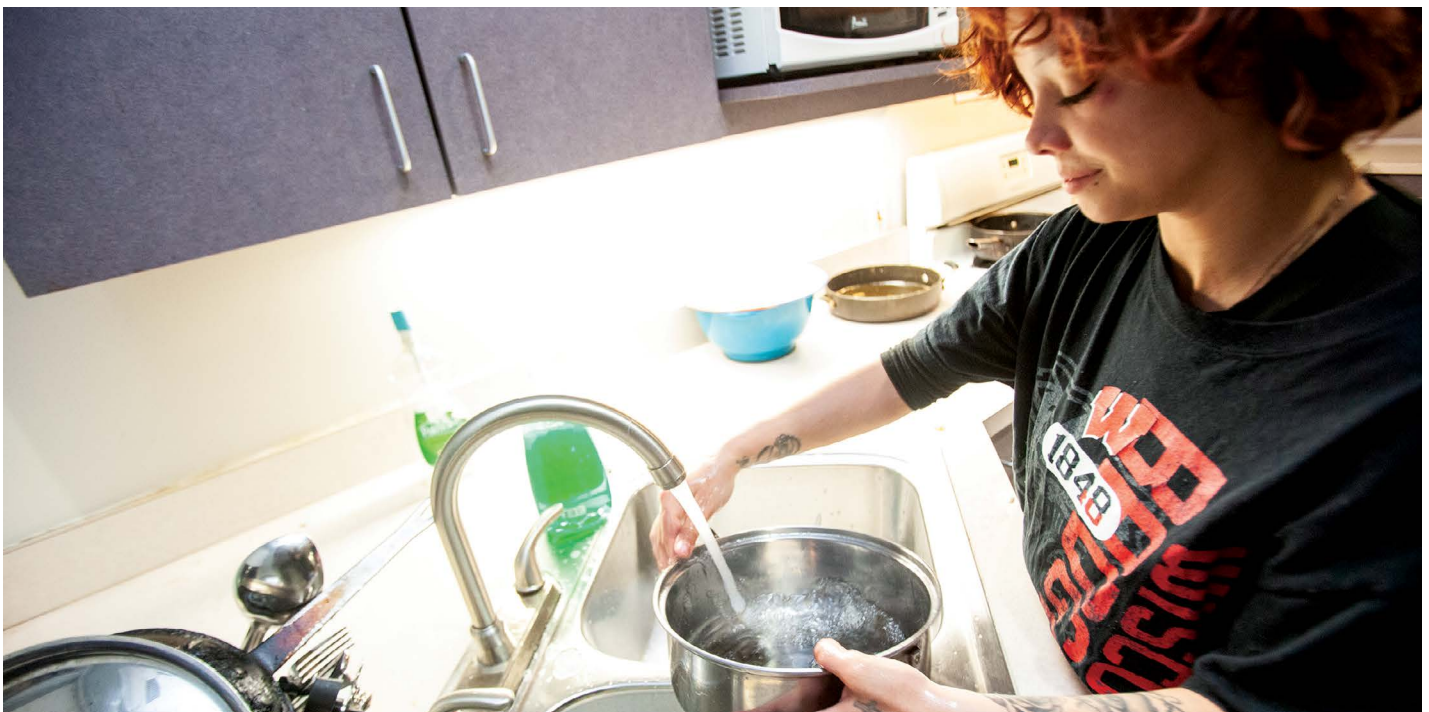
The transitional housing and supportive services offered at The Night Ministry help youth develop the life skills needed to live independently.

youth homelessness makes counting youth difficult because they often are not in shelter locations where traditional Point-in-Time (PIT) counts take place. 5 The January 2021 PIT count tallied 213 unaccompanied youth in Chicago; of these, approximately 89 percent were living in shelters and the remaining 11 percent were unsheltered outdoors. 6 Using the Chicago Homeless